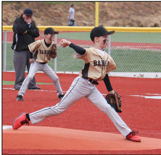
More baseball teams played in Medford than ever before (361 in the 10 annual City-run tournaments).

Overall team count was 1,716 with 54 percent of teams being from Medford or the Rogue Valley.